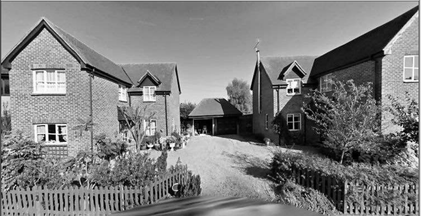
Above Google image showing the location in September 2011.

I am informed that the premises has been demolished for use as new houses. Date unknown at present, local knowledge required please.