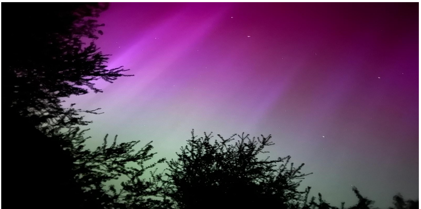
Northern Lights Friday 10 May 2024