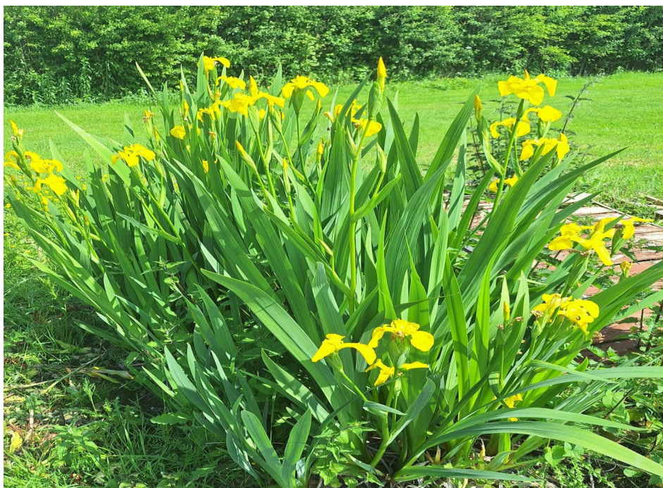
Allotment irises.

If interested please contact Aysha on studiojamie@icloud.com or 01424 883238.