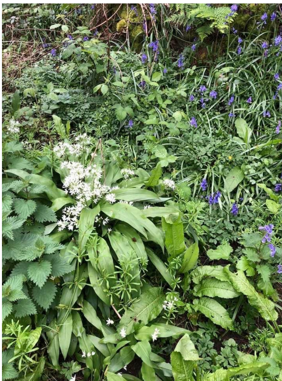
Photo of wild garlic and bluebells taken by Tracy Morgan on the Appledore Ramble.