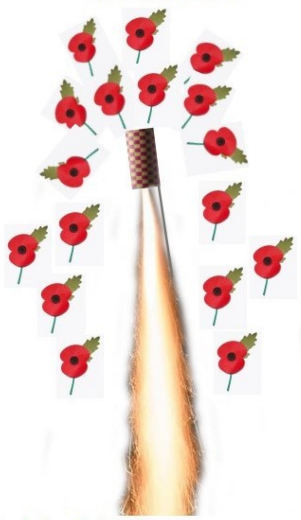
Appledore Parish Magazine