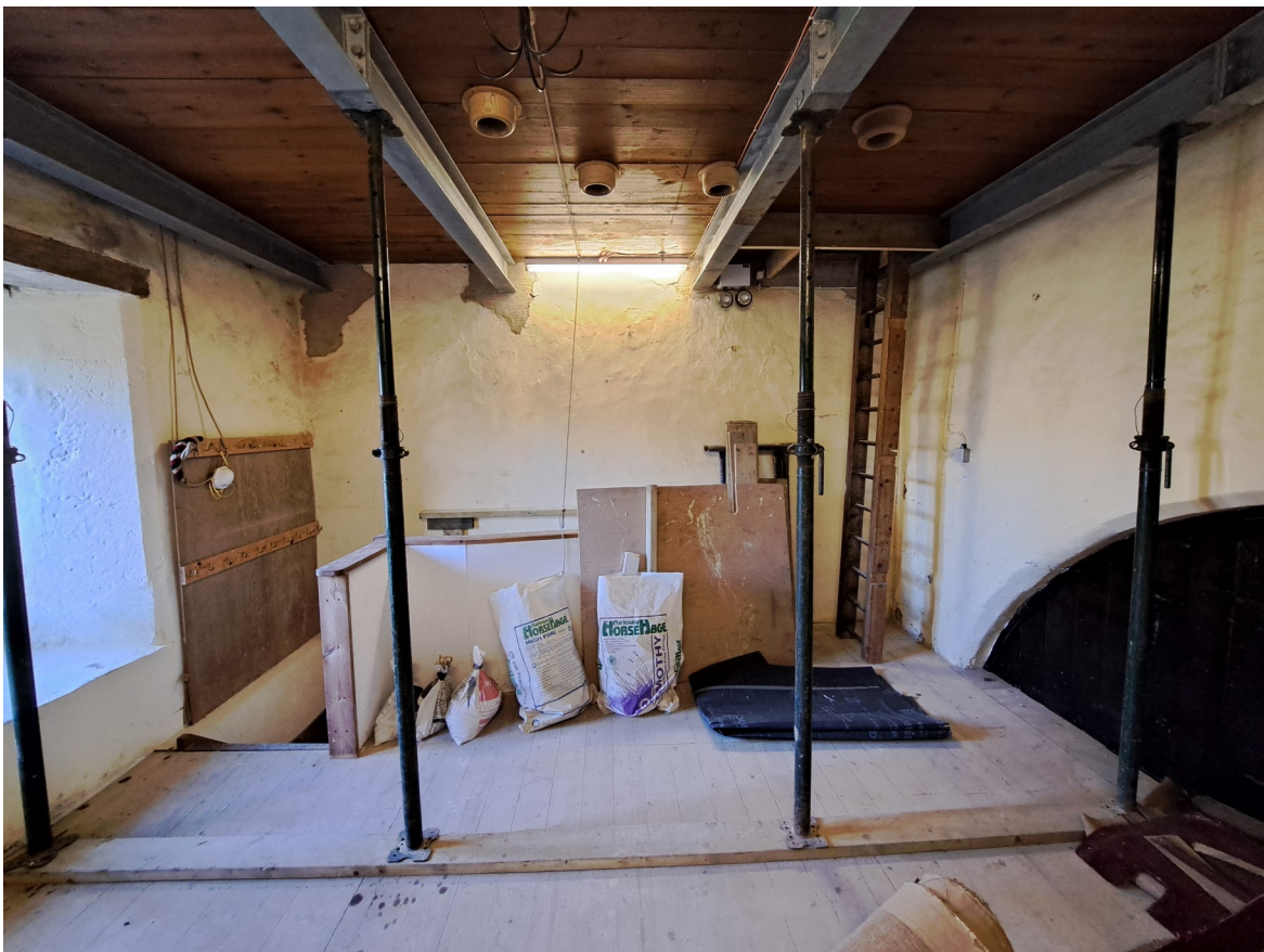
The Ringing Chamber with new RSJ's being fixed in position.