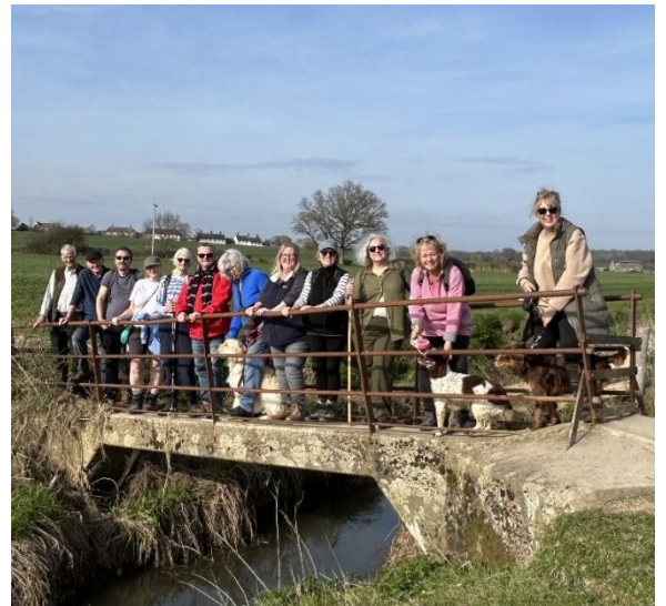
We reach a bridge and I make everyone line up so I can get a photo of our motley crew!

As we step off the end of the bridge we spot a large raven that is pecking at something on the ground that it has obviously caught.